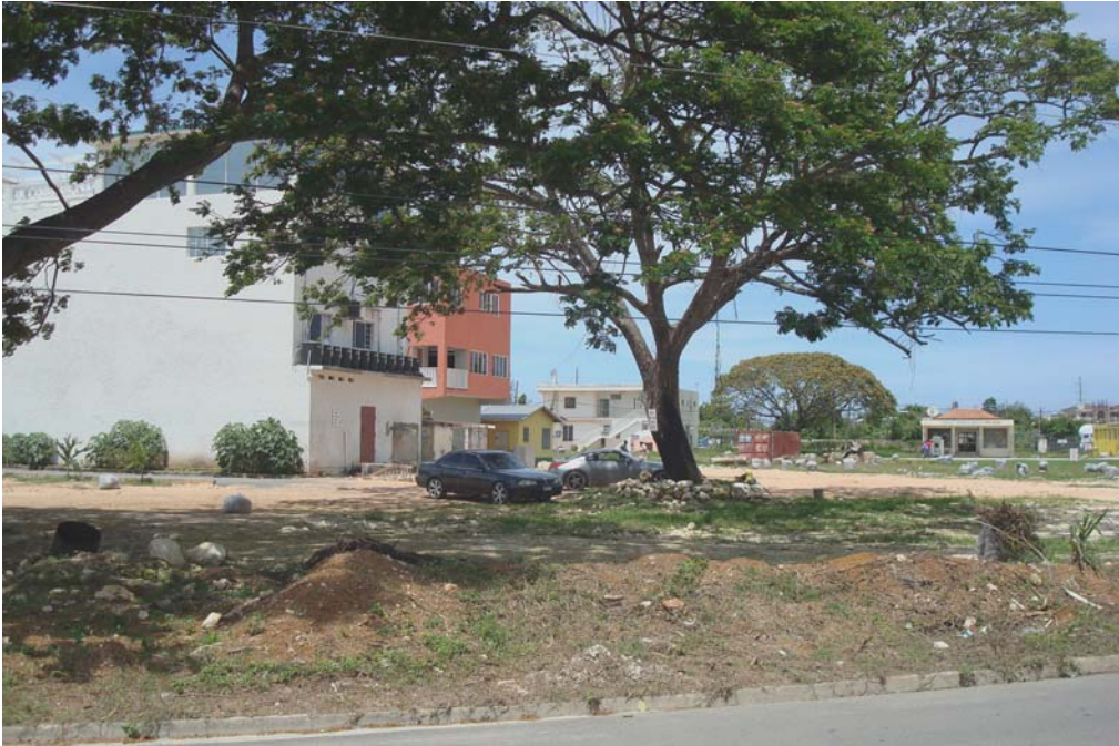
View of lot