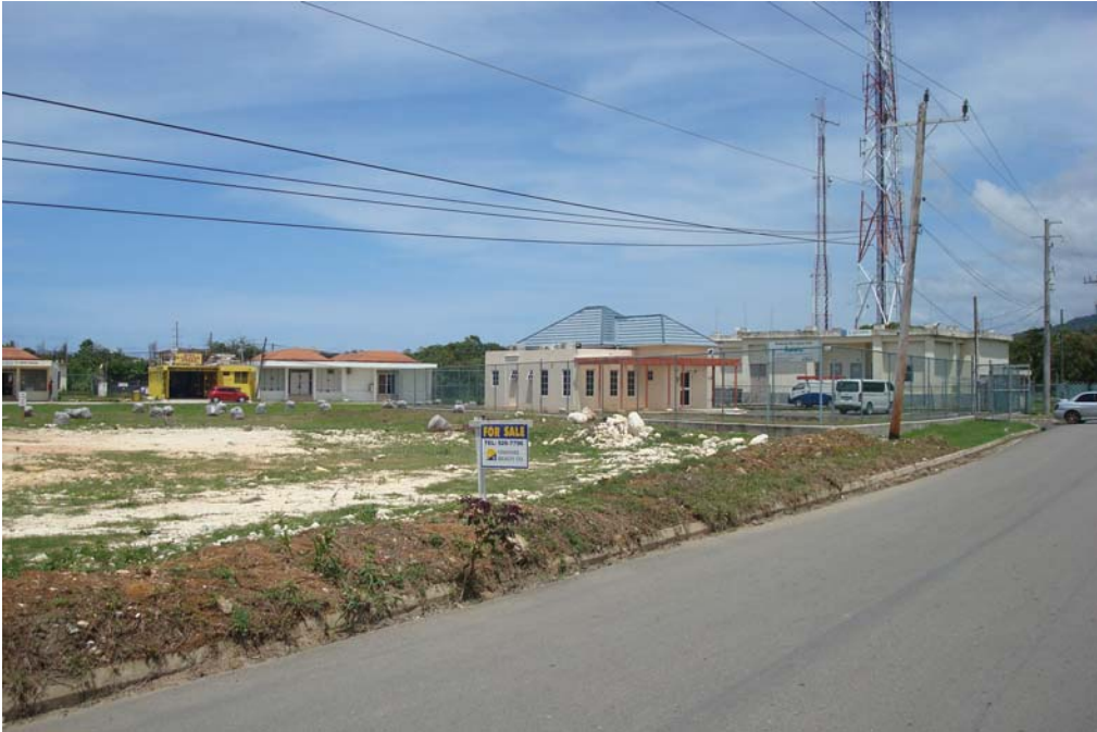
View of Lot