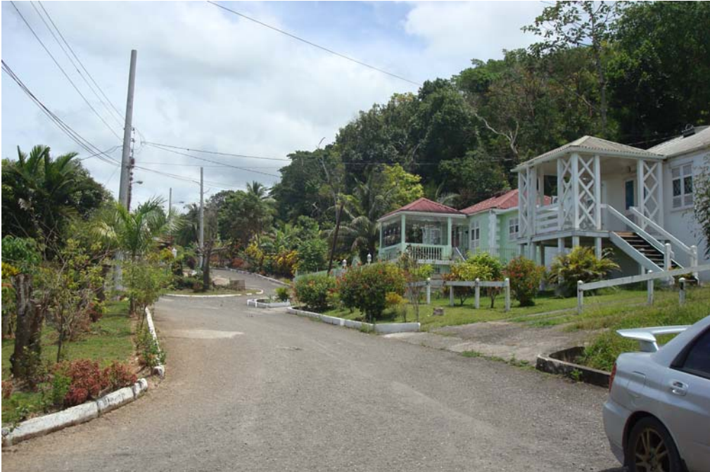
Lot -Street View